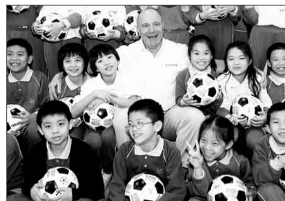
Former England footballer and World Cup hero George Cohen visits Po Leung Kuk to show off his football skills and the World Cup trophy yesterday in Causeway Bay.

The World Cup star, who won 37 international caps, had a kick-